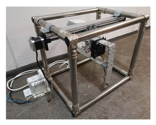
Figure 2: Setup of the printing process simulation system

lifetime can be determined on the basis of the existing lifetime model and adapted to the lifetime specified by the UV lamp manufacturer.