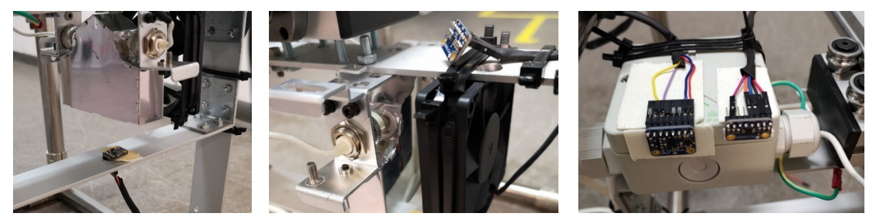
Figure 3: UV sensor under the UV lamp with reflector unit, temperature sensor next to the UV lamp, acceleration and temperature sensor in the upper part of the printing chamber (from left to right)

The required sensors are retrofitted to the printing process simulation system (see Figure 3).