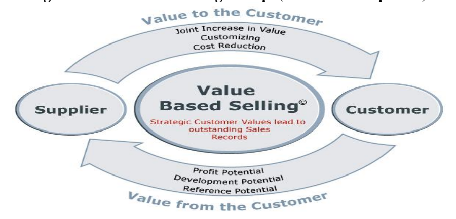
Fig. 1: The value-based selling concept

Customer Success Management is based on complex multi-channel sales, designed to act holistically. It shows that some aspects are more important for successful business management than many proven concepts. For example, clean segmentation, stringent buying center analysis, and accurate formulation of the customer benefit-oriented value proposition Customer Success Management is the next evolution in within the framework of the value-based selling concept remain complex sales (Hilton et al. 2020) that drives growth indispensable (Eggert et al. 2018). In addition, value-based (Vaidyanathan & Ruben 2020). Sales must continuously think selling includes the focus on strategic values that ensure